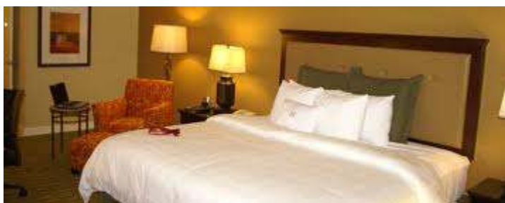
One of the rooms at the Crowne Plaza (maybe yours?)

President Zorn has a block of rooms reserved at the Stoddert Reunion group rate of $90 per night for a Standard sunset-view room (2 double, a queen, or king beds), $100 per for the Standard river-view rooms, and River-view Junior Suites for $140 per night. Hotel reservations should be made by calling 904.398.8800. Be sure to ask for the Benjamin Stoddert discount! The hotel staff advised to NOT call the 1-877 reservation number, but to call direct to the hotel to ensure your discount. The cancellation policy requires notifying the hotel by 6 pm 3 days prior to your reservation to cancel or change. Failure to cancel in time can cost one night’s rate.