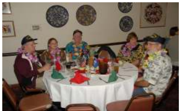
One of the tables at the Luau, a seated dinner.