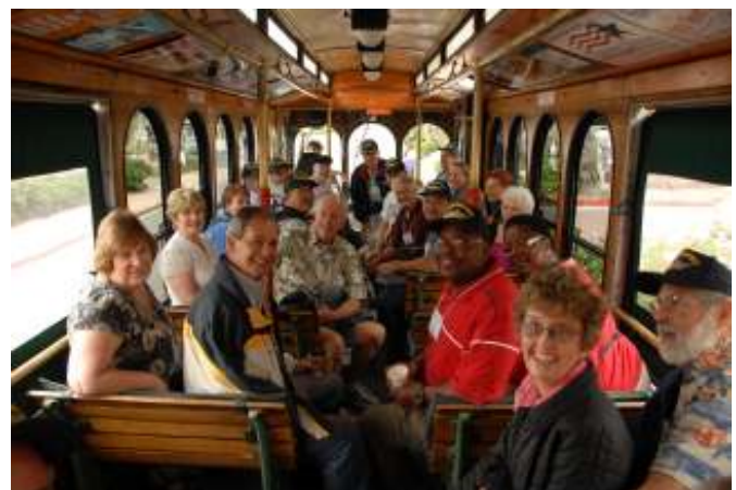
Trolley Tour #1, ready to depart.