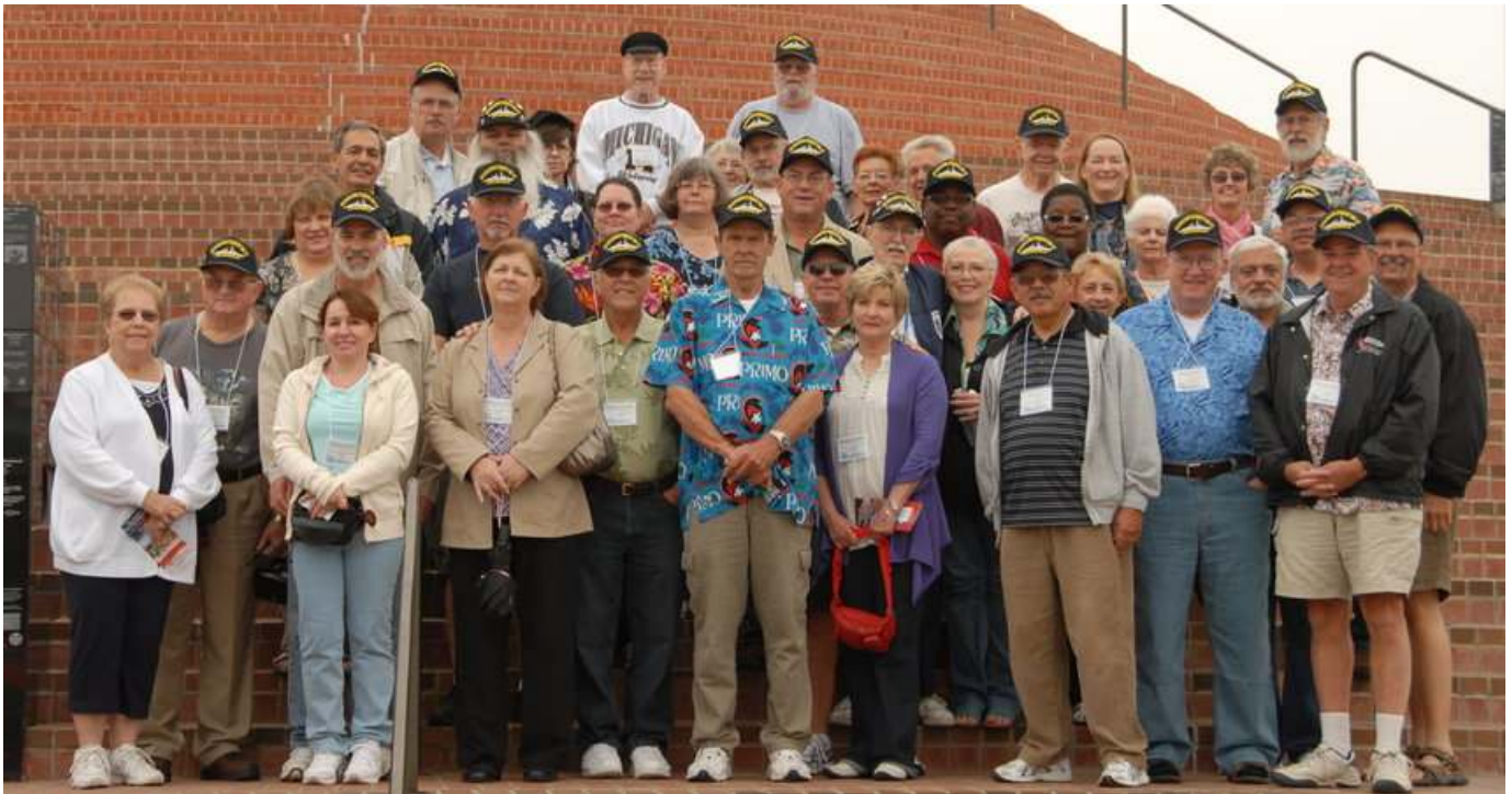
This was most of the tour group—taken at the Military Memorial at Cabrillo Park